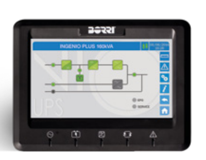
*Optional touch screen display (on 60-160 kW UPS)