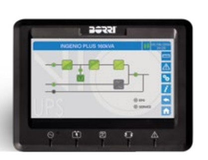
*Optional touch screen display (on 60-160 kW UPS)