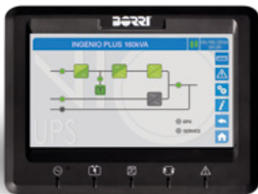
*Optional touch screen display (on 60-160 kW UPS)