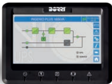
*Optional touch screen display (on 60-160 kW UPS)